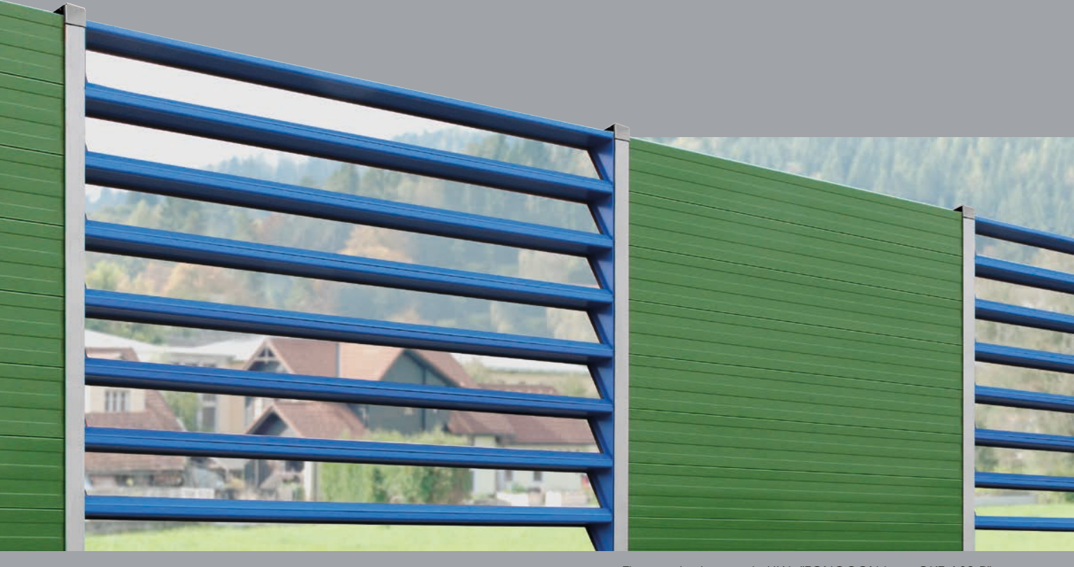
The product name in UK is "FONOCON type GKE A30-P".

The noise barrier that offers a clear view