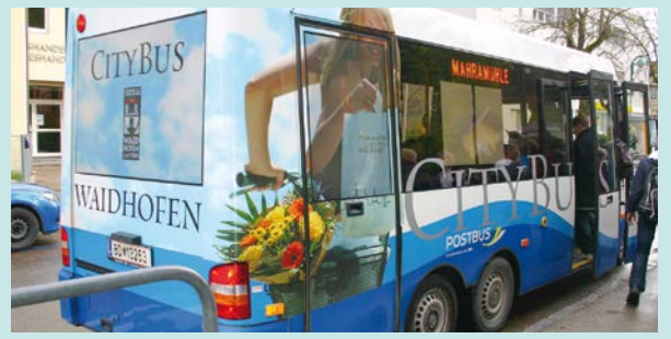
Advertising systems - vehicle signage, exhibition advertising, adhesive film and signs