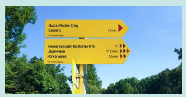
Hiking trail signs