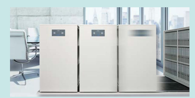
Mobile and stationary shelving systems

For more information on our product range please visit www.forster.at