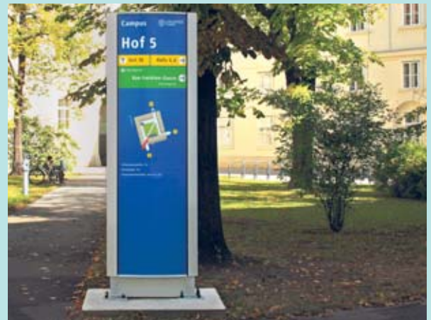
Combiflex CF 60 monument sign systems