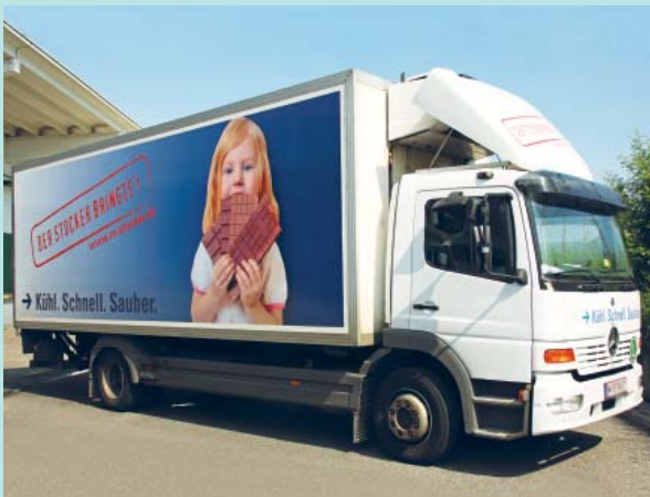
Advertising systems - vehicle signage, exhibition advertising, adhesive film and signs