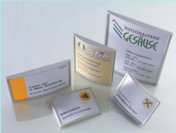
Combiflex Meneo indoor signs