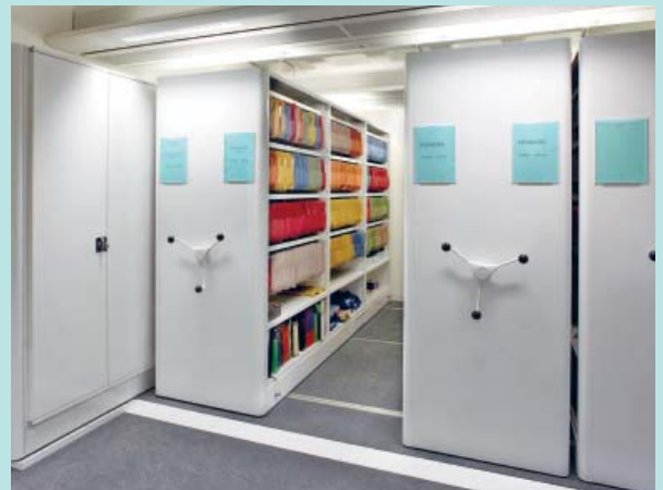
Mobile and stationary shelving systems

For more information on our product range please visit www.forster.at