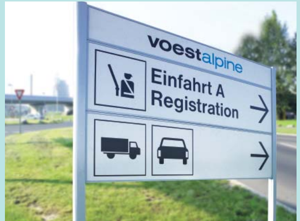
Combiflex CF 40 outdoor signs