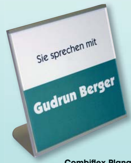
Combiflex Plana desktop sign