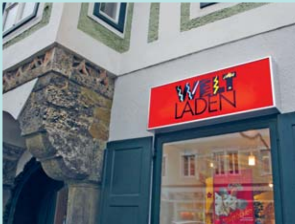
Combiflex CF 50 internally lit advertising signs