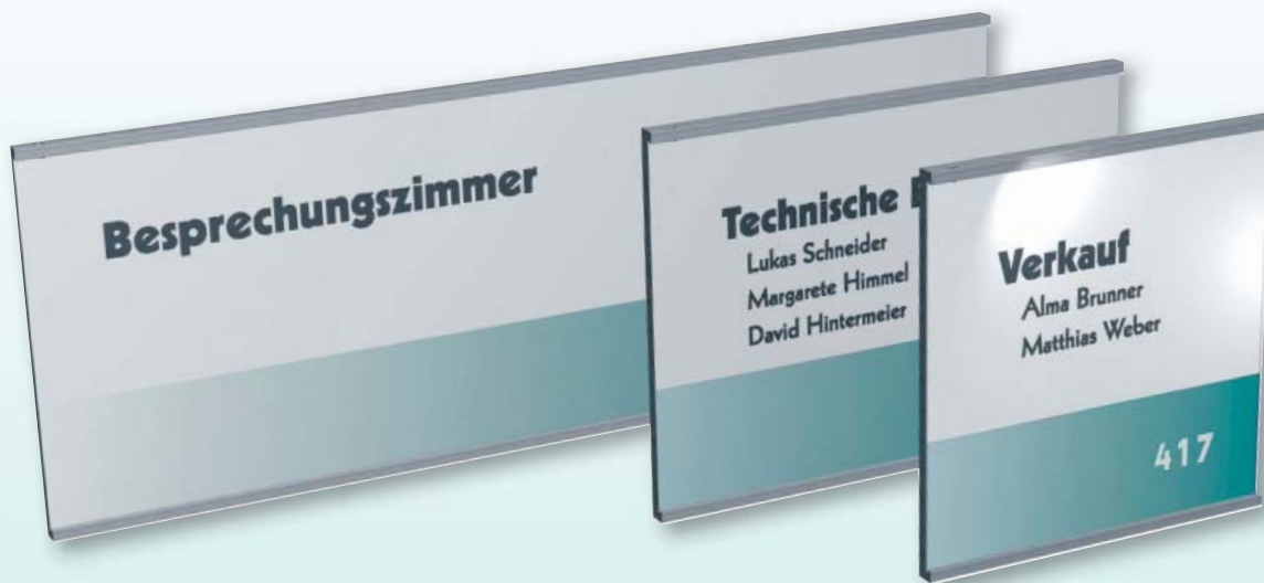
Combiflex Plana doorsigns

Flat door signs (8 mm depth), made of anodised aluminium sections and glare-free acrylic glass covers. Fitted with slide-in paper labels.